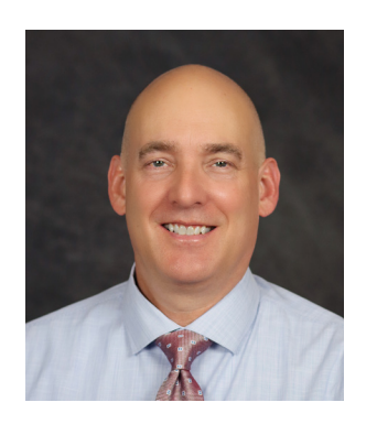
EDUCATION BS, Building Construction, University of Florida