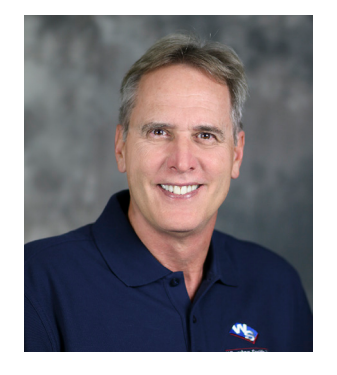
EDUCATION BS, Construction Technology, Murray State University