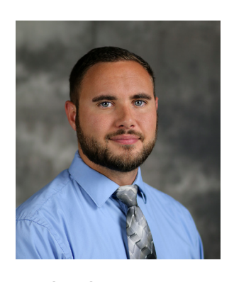
EDUCATION BS, Civil Engineering, University of Central